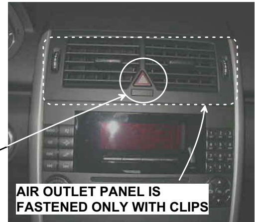
AIR OUTLET PANEL IS FASTENED ONLY WITH CLIPS